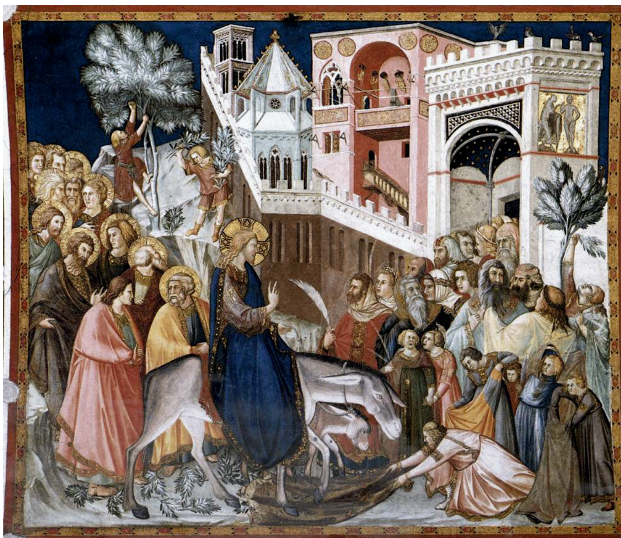
Entry of Christ into Jerusalem (c. 1320) by Pietro Lorenzetti