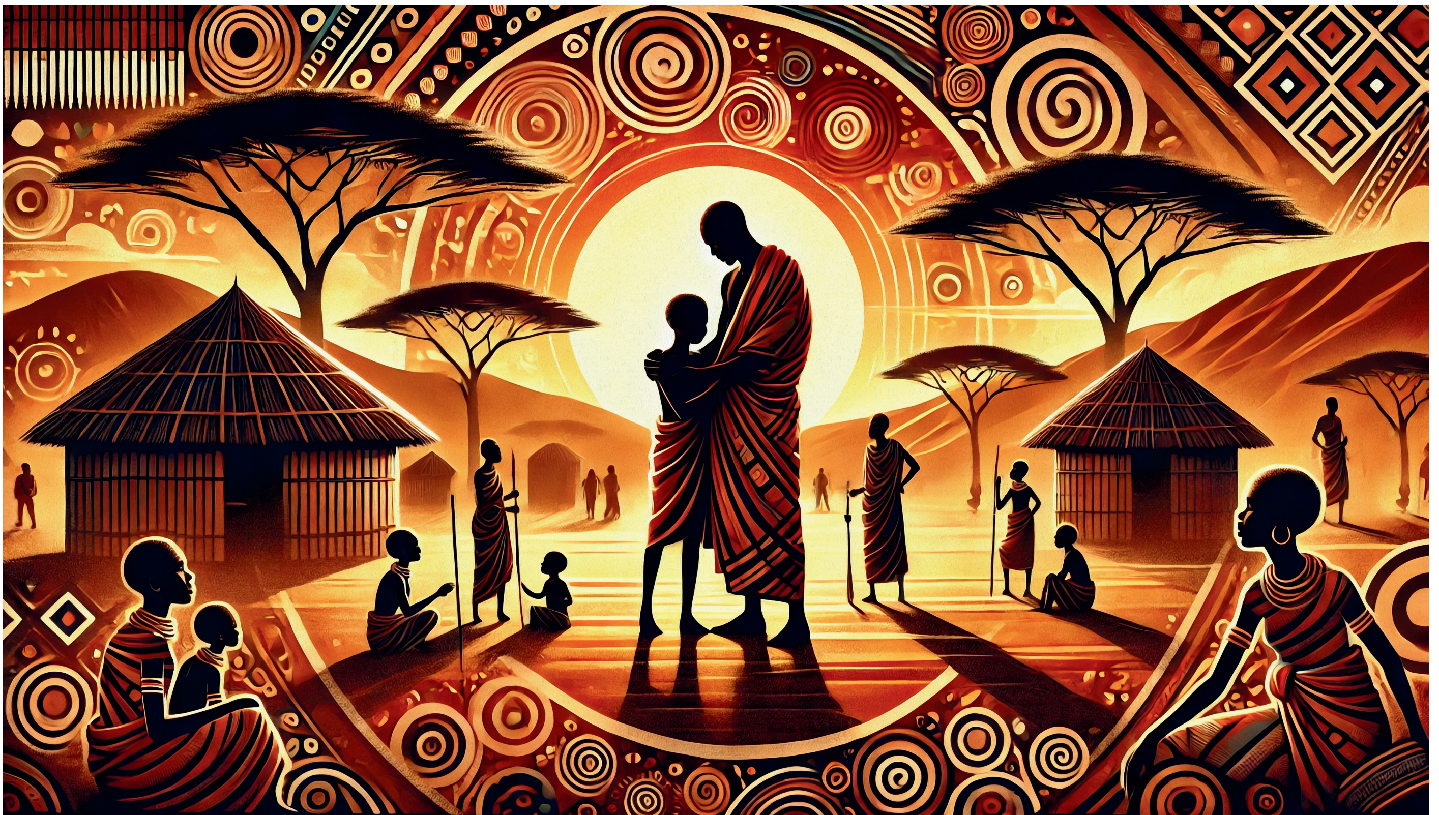
"Mora Ya Lehlaswa" (The Prodigal Son) Designed by Christian Art Expo