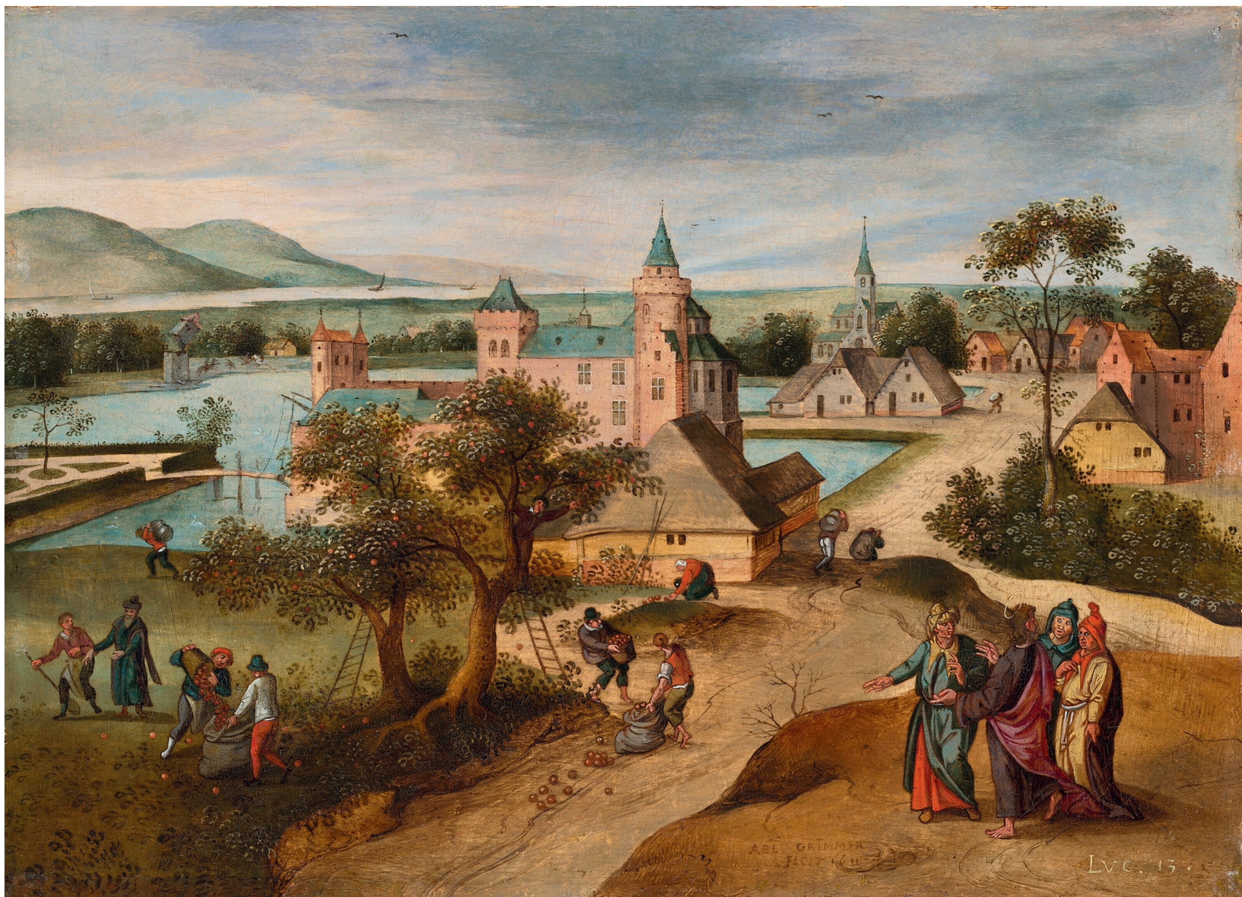
The Parable of the Barren Fig Tree (1611) by Abel Grimmer