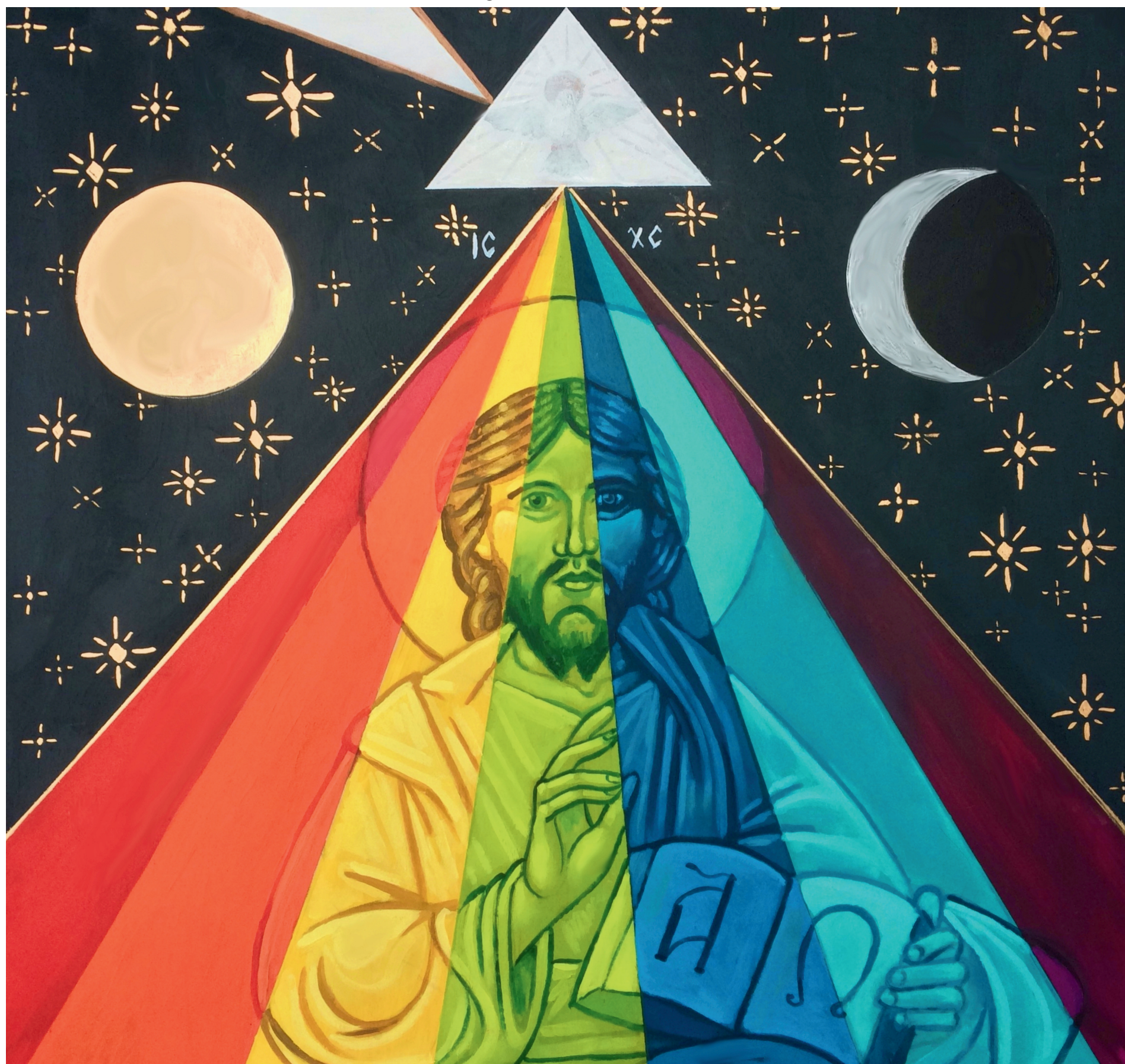
Christ the Light (2020) by Kelly Latimore