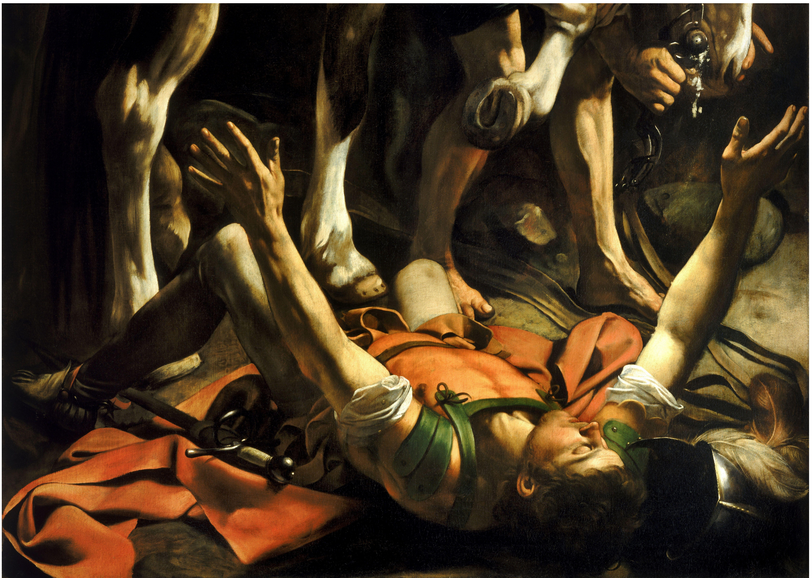
The Conversion of Saint Paul, c. 1600-1601 (Caravaggio)