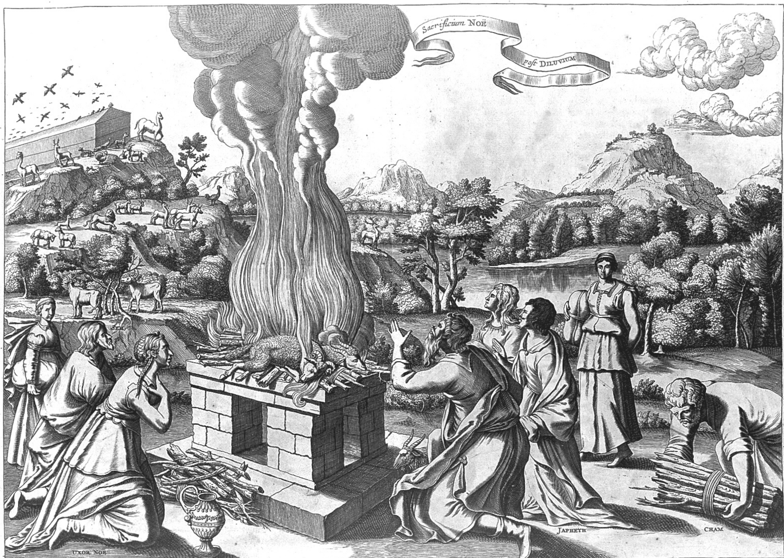
Thanksgiving Sacrifice After Flood, c.1675. (A. Kircher)