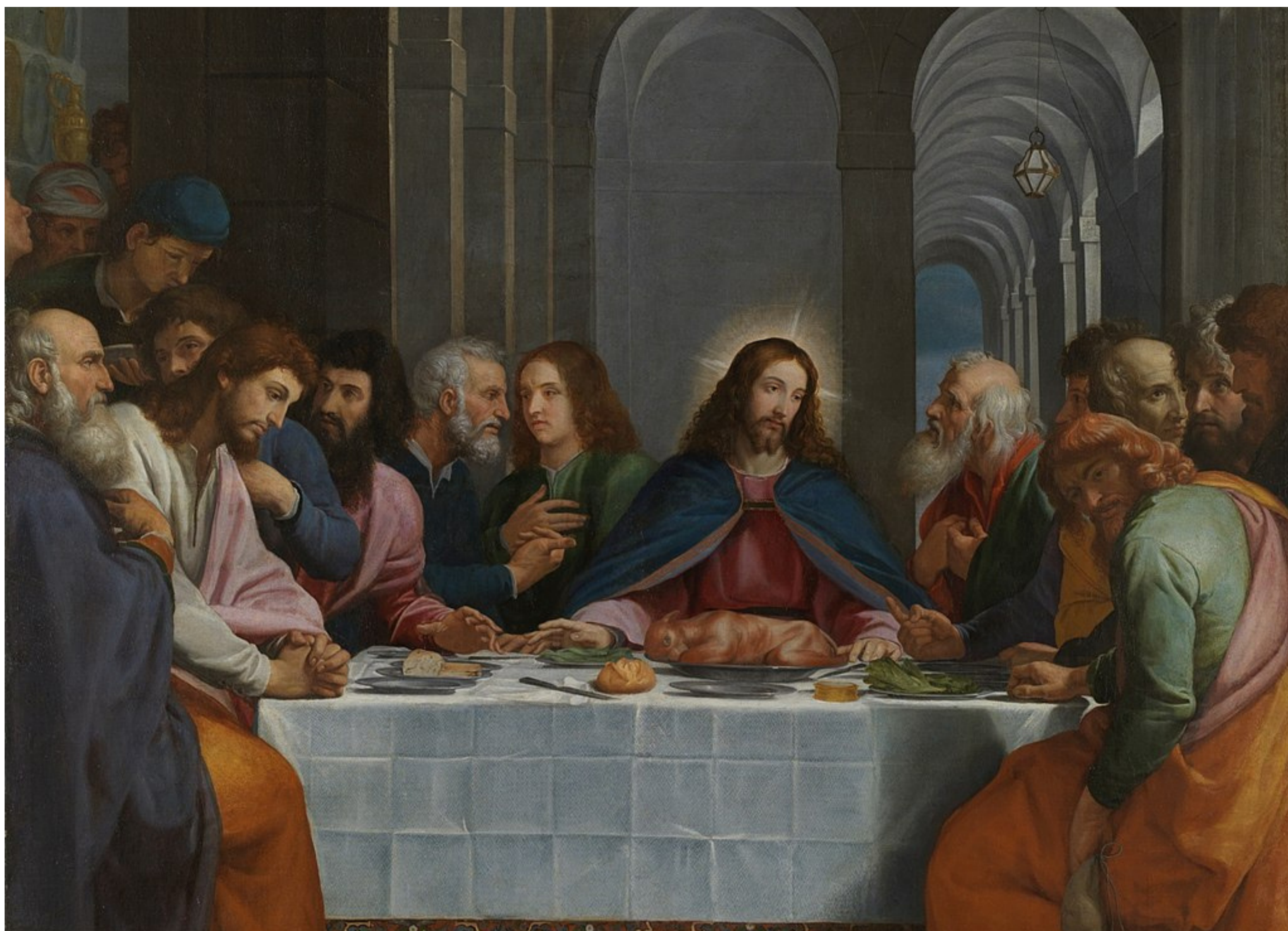
La Última Cena, c.1605 (Bartolomeo Carducci)