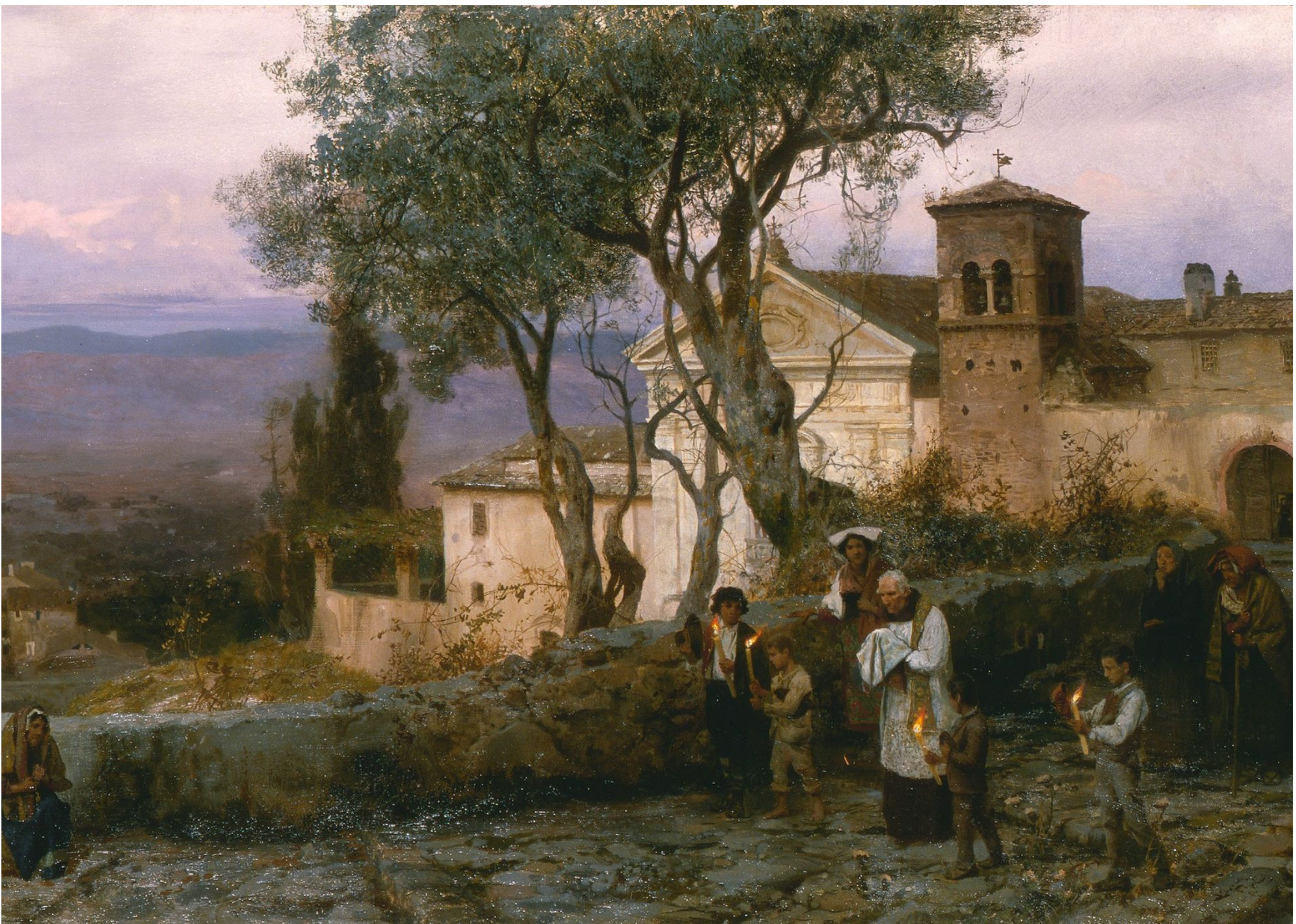
Viaticum , c. 1889 (Henryk Siemiradzki)