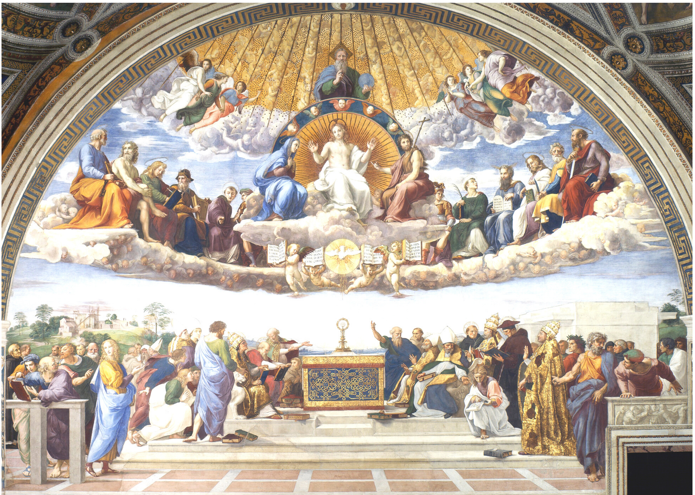
Disputation of the Holy Sacrament, c. 1509–1510 (Raphael)