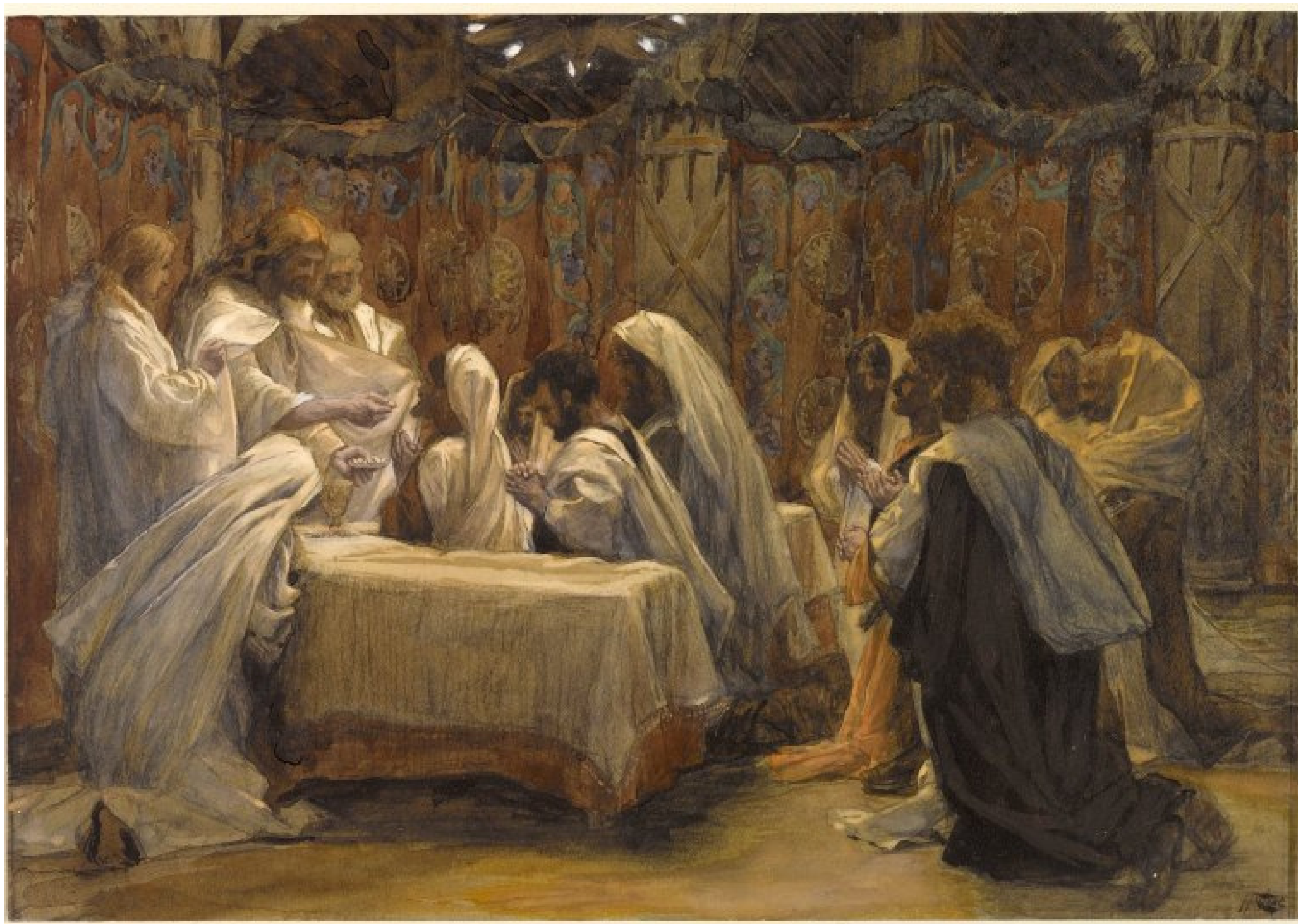
The Communion of the Apostles, c. 1886-1894 (James Tissot)