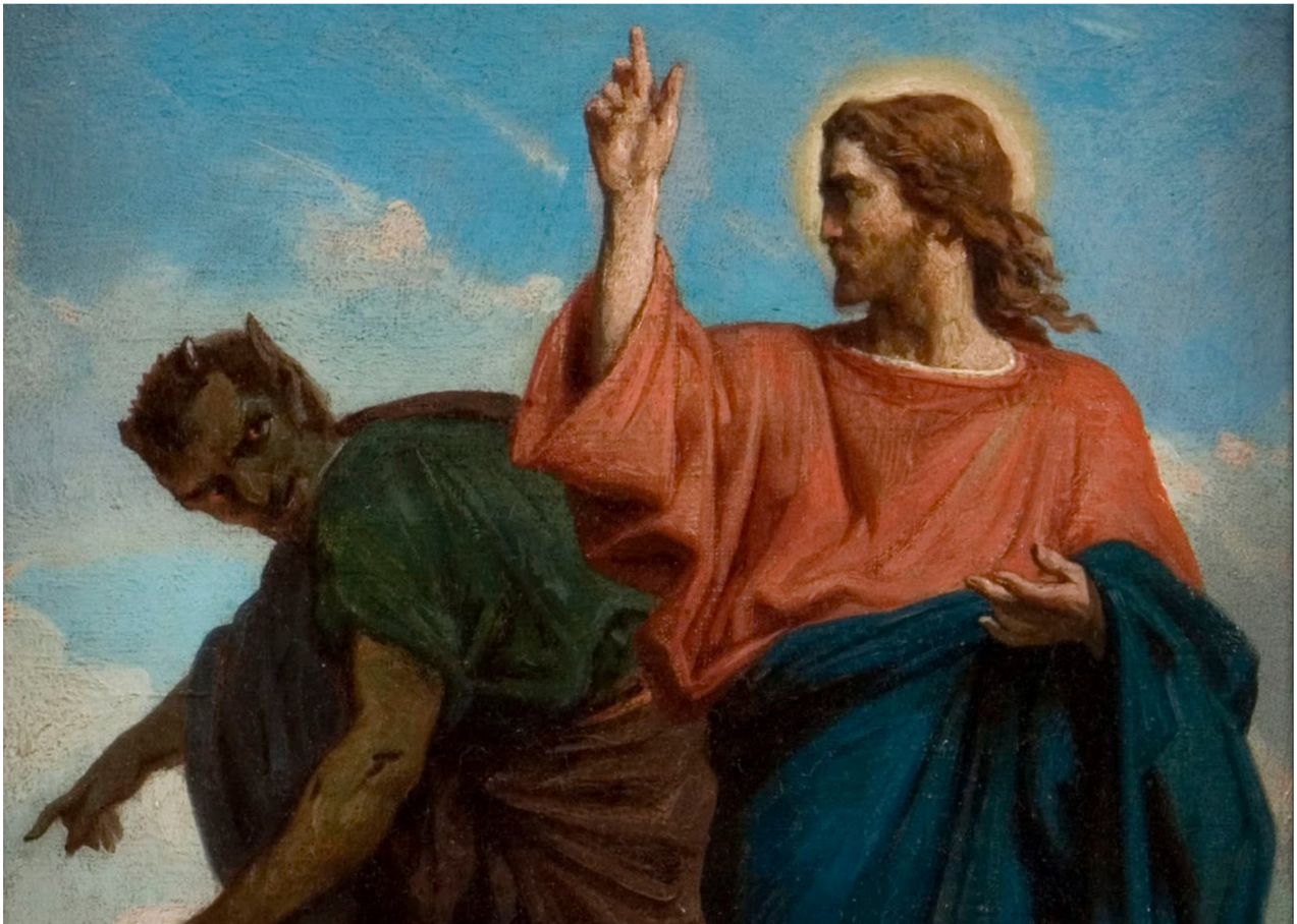
The Temptation of Christ by the Devil , c. 1860 (Félix Joseph Barrias)