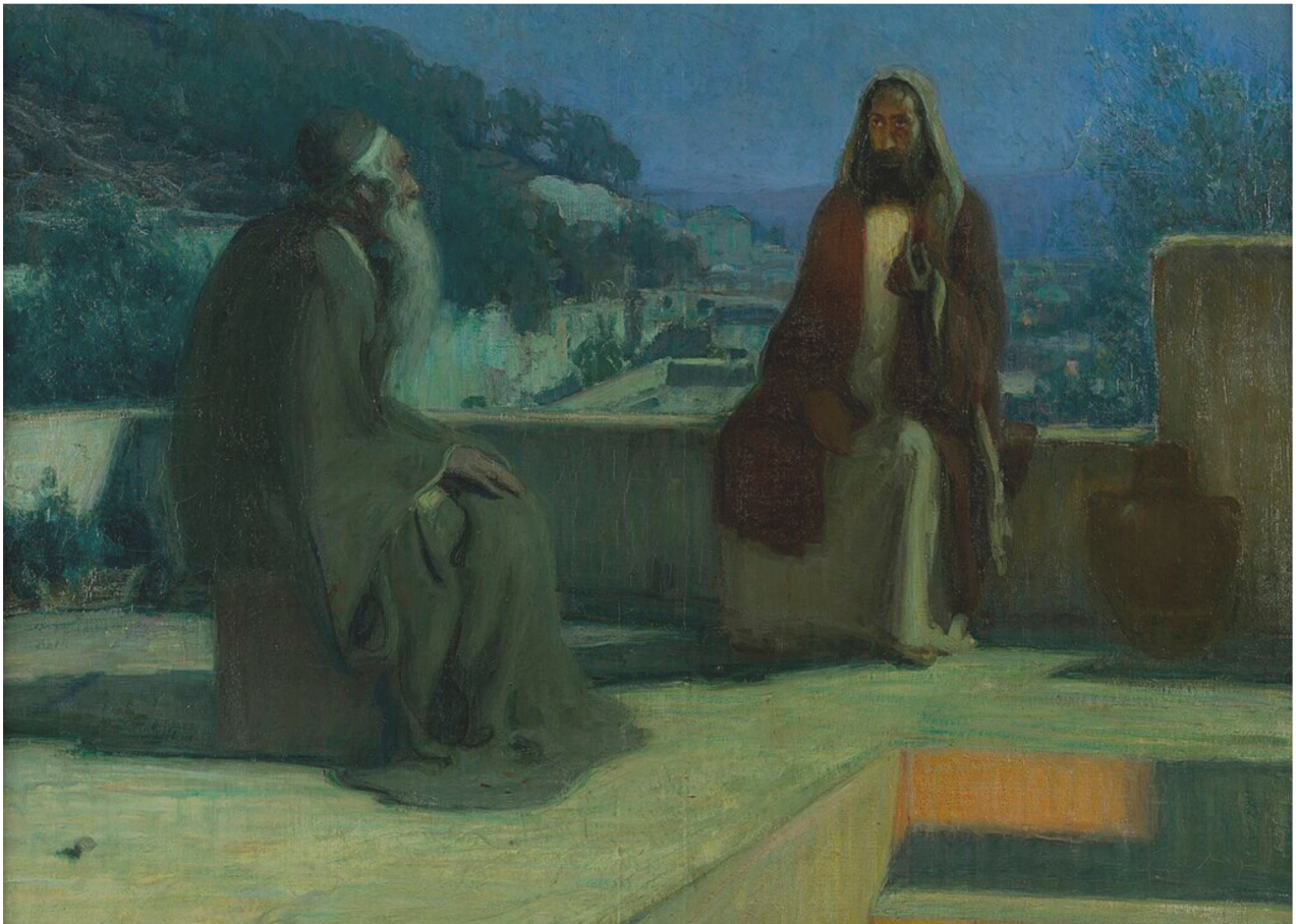
Nicodemus Visiting Jesus , 1899 (Henry Ossawa Tanner)