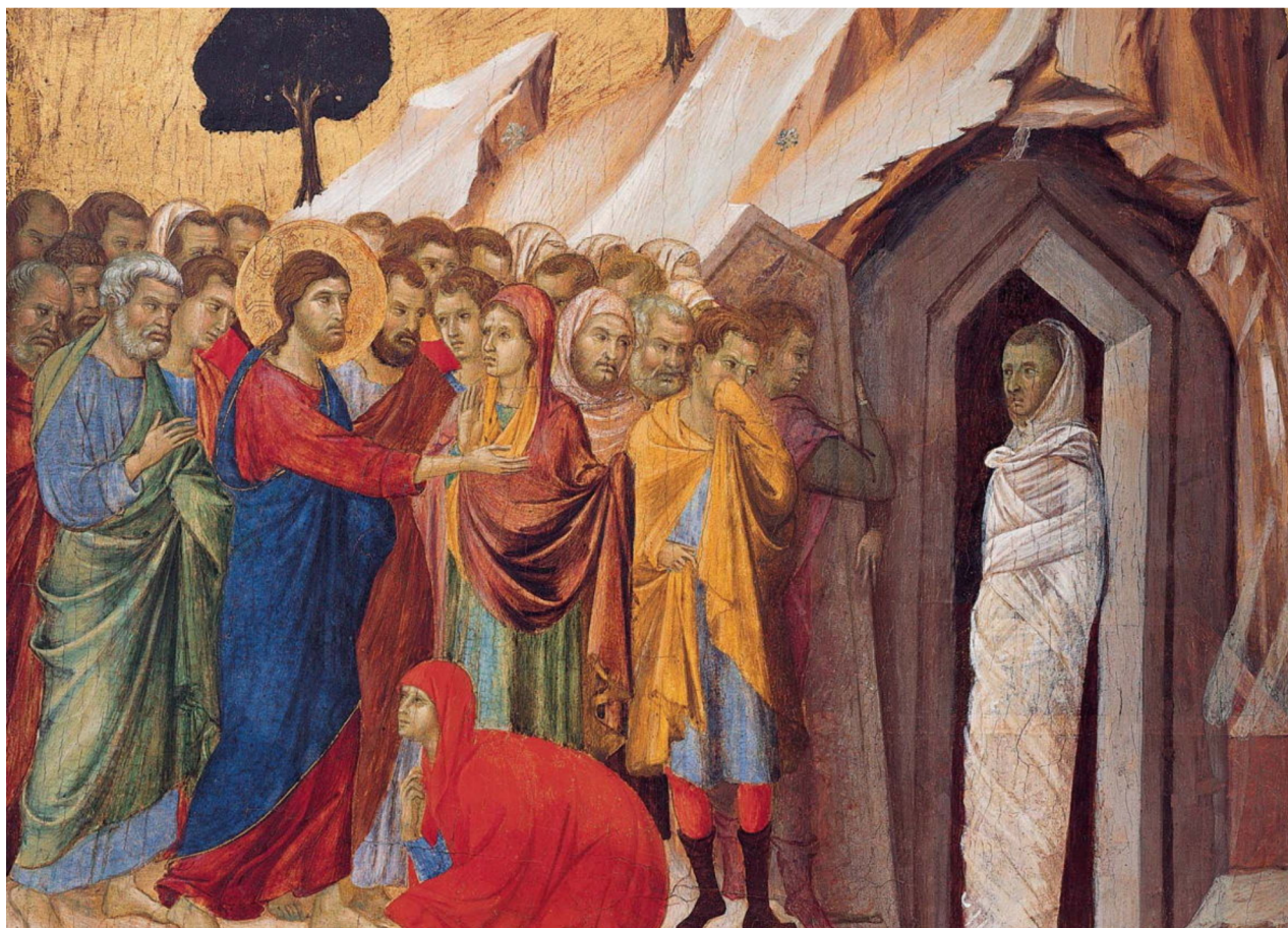
The Raising of Lazarus, 1310 (Duccio di Buoninsegna)