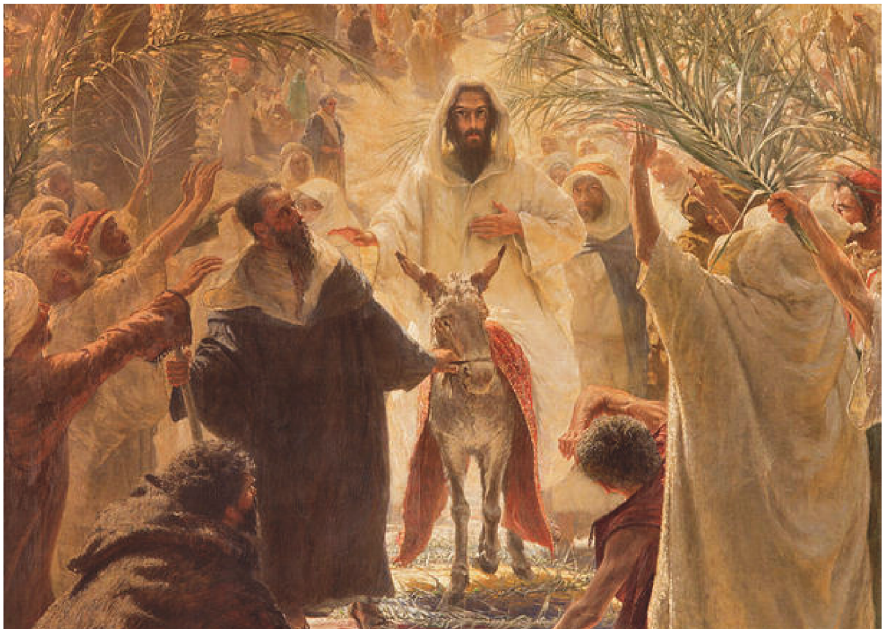
The Point of Entry of Jesus in Jerusalem, c. 1896 (Felix Tafart)