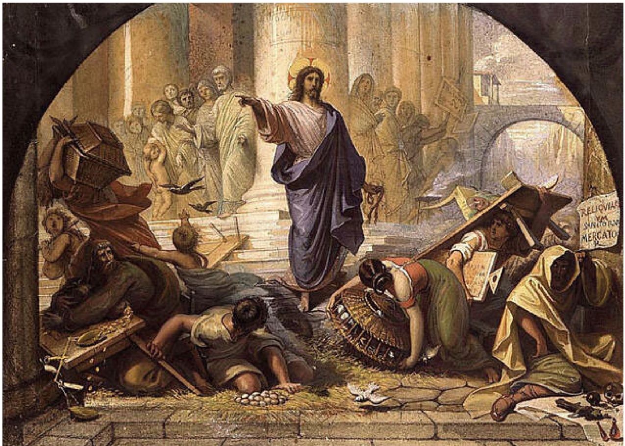
Jesus Chasing the Merchants from the Temple, c. 1850 (Raymond Balze)