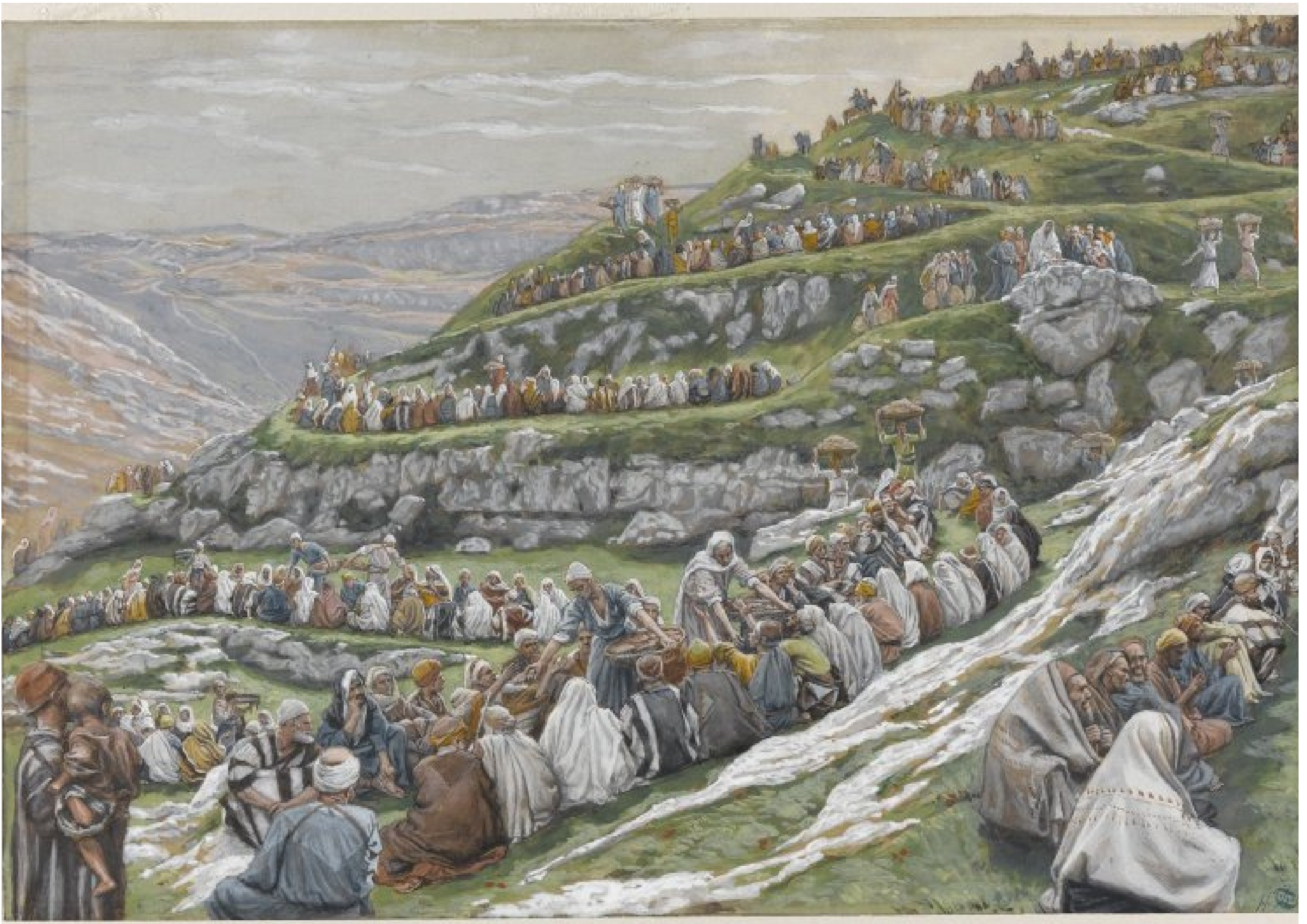
The Miracle of the Loaves and Fishes, c. 1886-1896 (James Tissot)