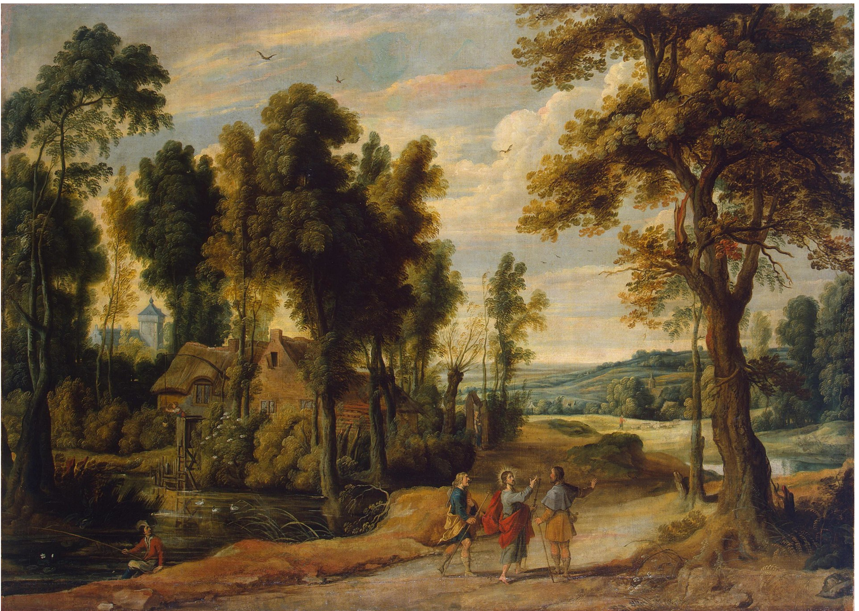
Landscape with Christ and his Disciples on the Road to Emmaus, c. 1640s (Jan Wildens)