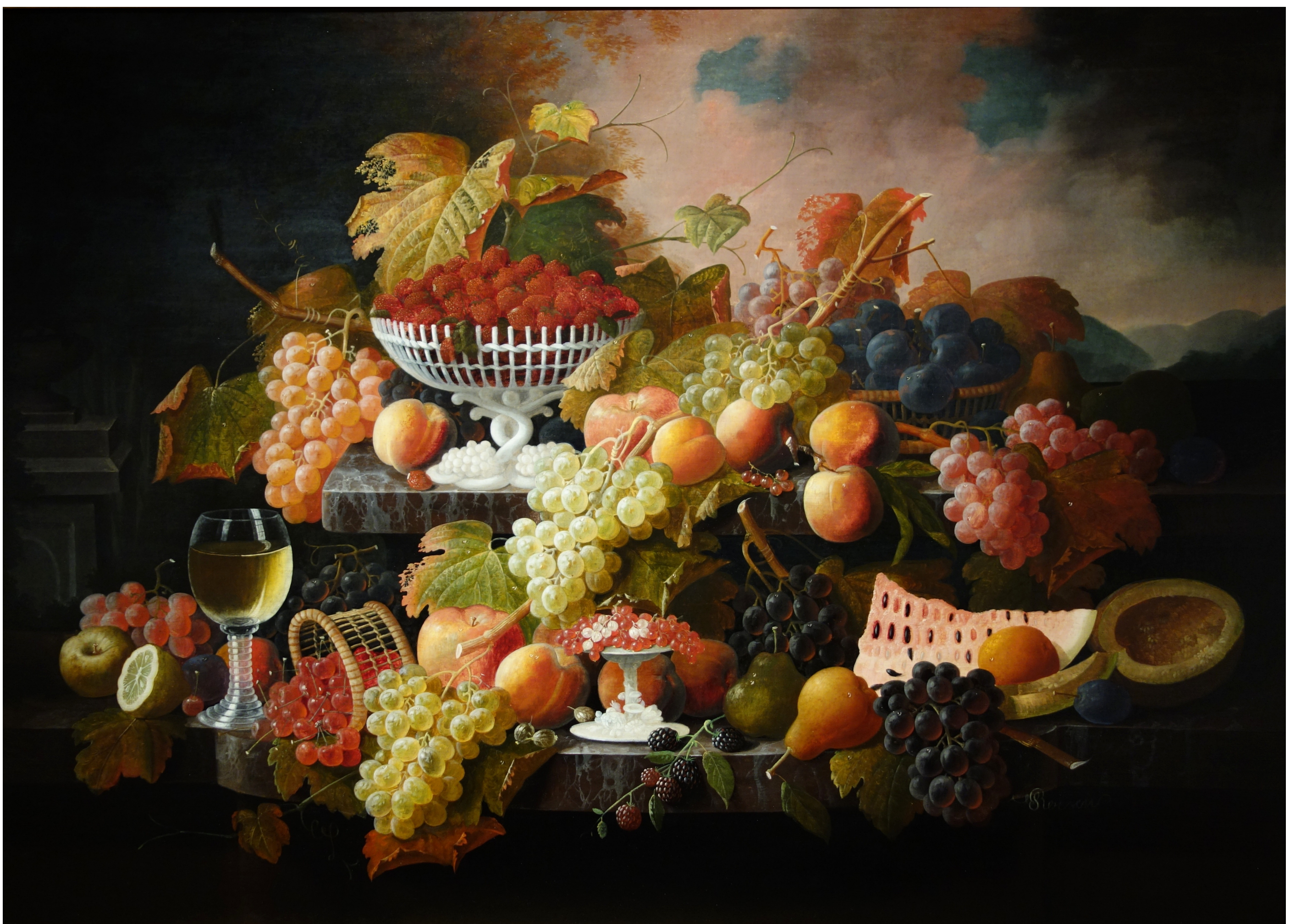
Still Life, New Britain Museum of American Art