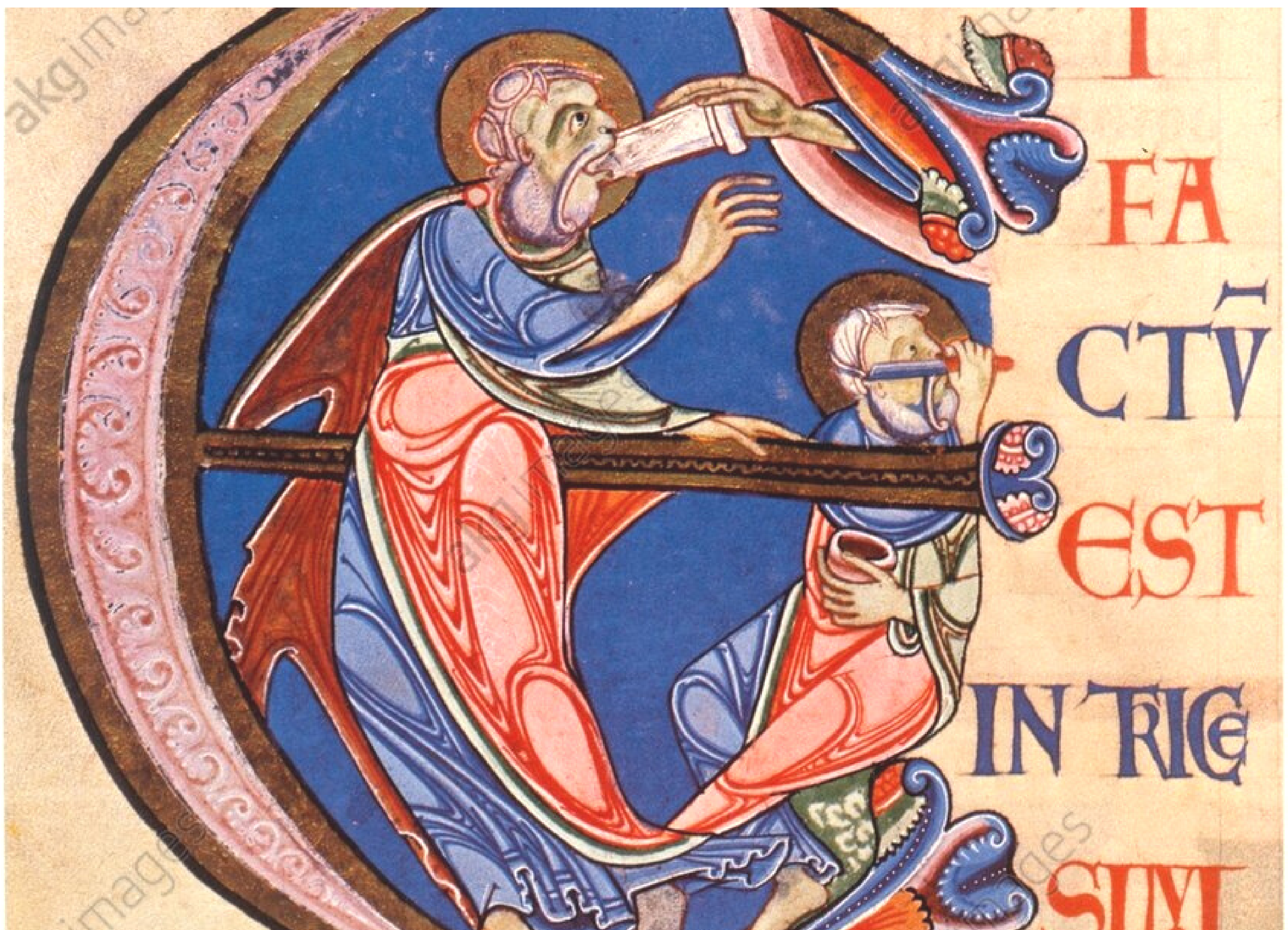
Illuminated manuscript, c.1146. From the Lambeth Bible, London, Lambeth Palace Library