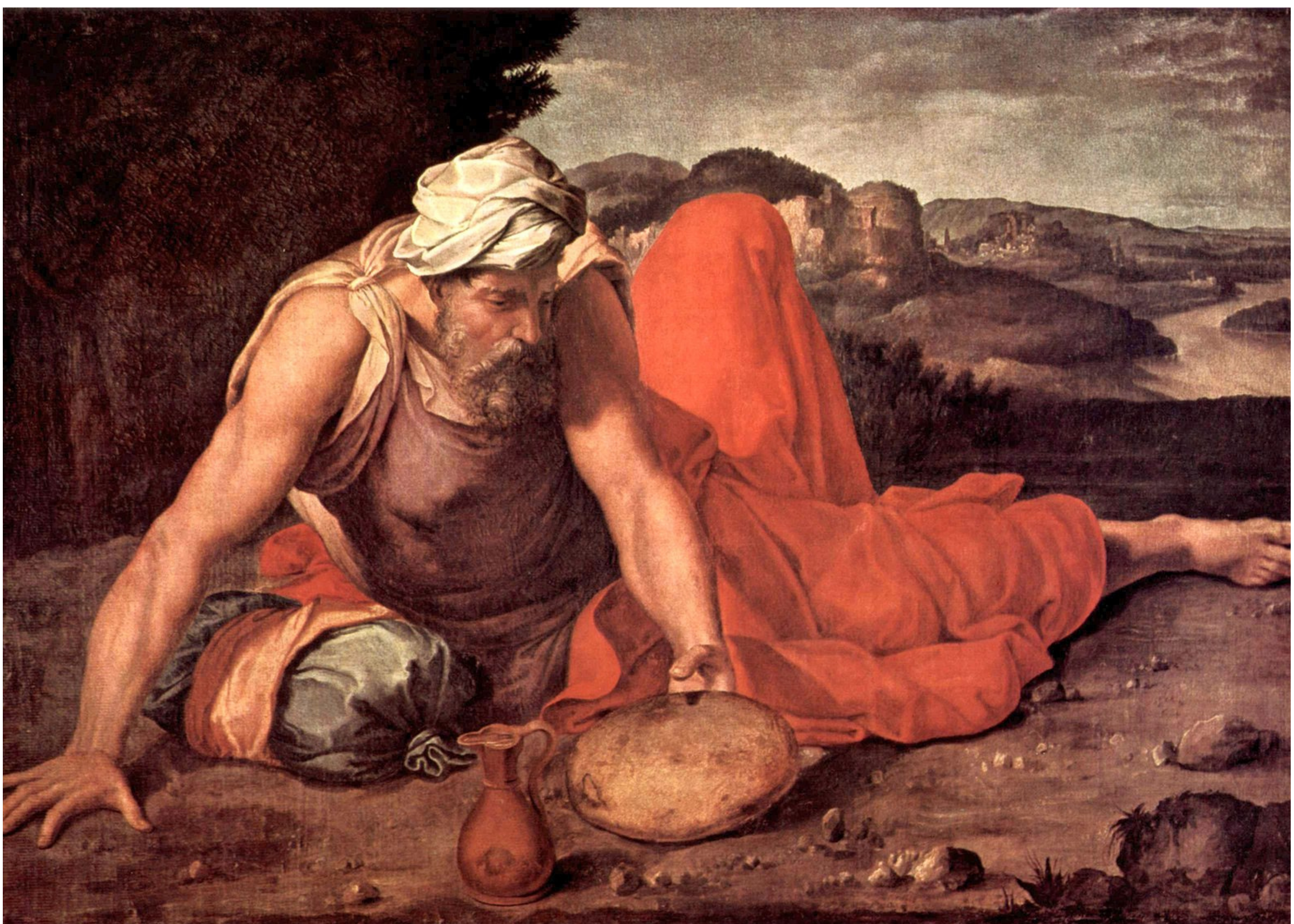
The Prophet Elijah , c. 1550-1560 (Daniele da Volterra)