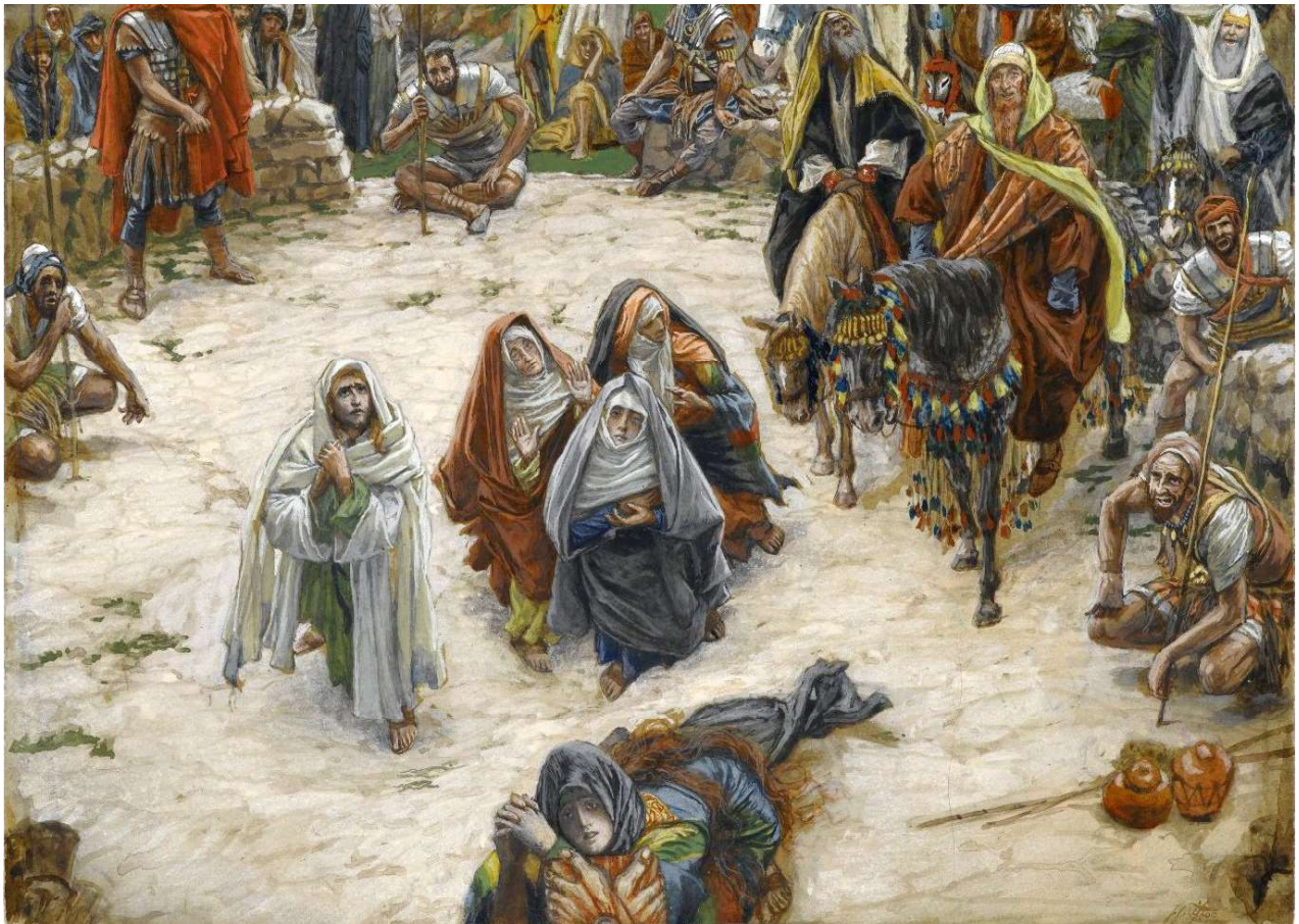
The Crucifixion, seen from the Cross, c.1890 (James Tissot)