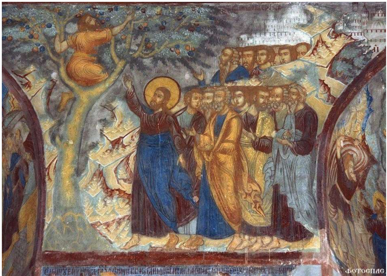
Zacchaeus in the Tree, (Greek Orthodox Icon)