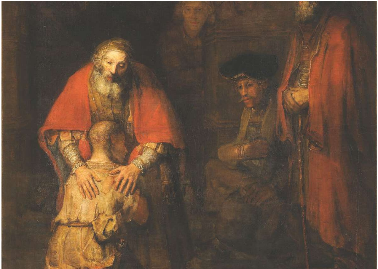
Return of the Prodigal Son, c.1661-1669 (Rembrandt)