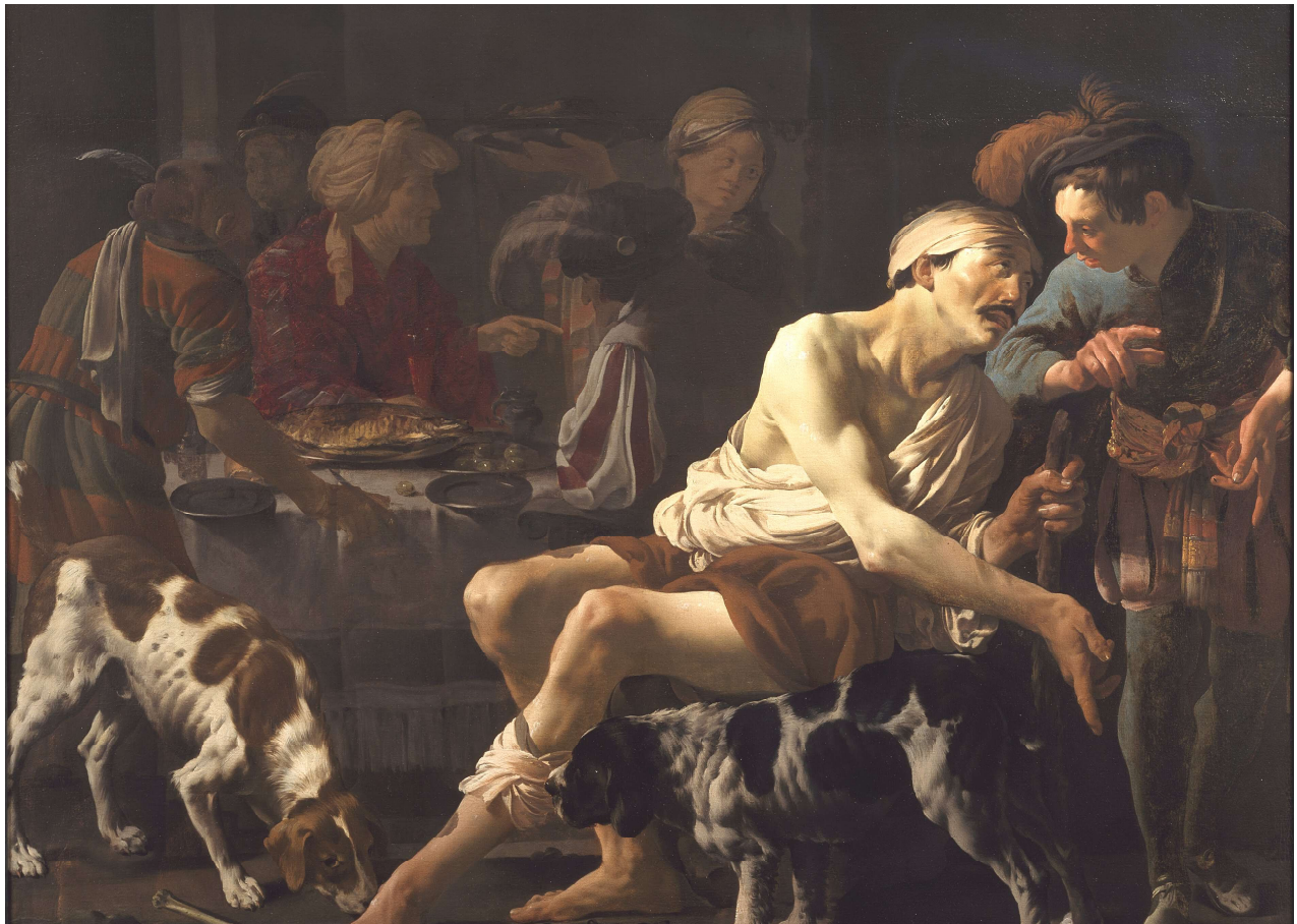
The Rich Man and the Poor Lazarus , c. 1625 (Hendrick ter Brugghen)