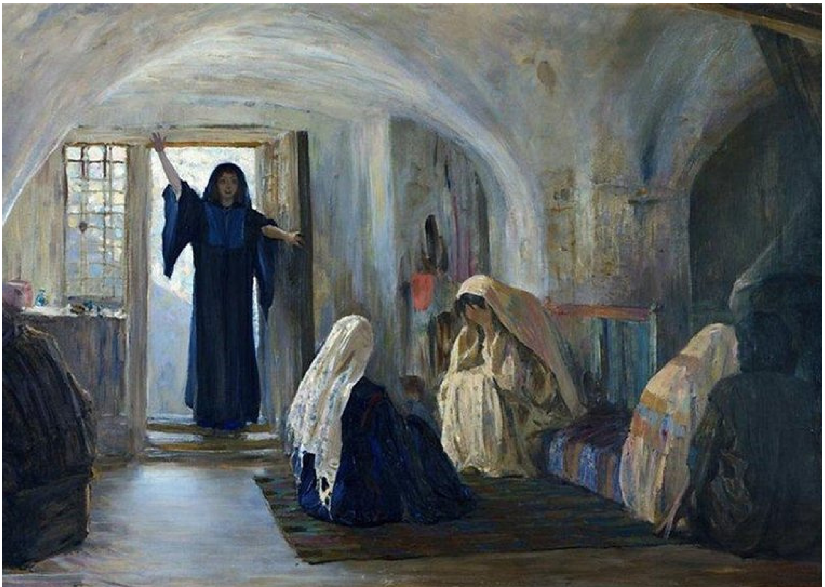
Mary Magdalene Announces the Resurrection to the Apostles, c. 1890 (Vasiliy Polenov)