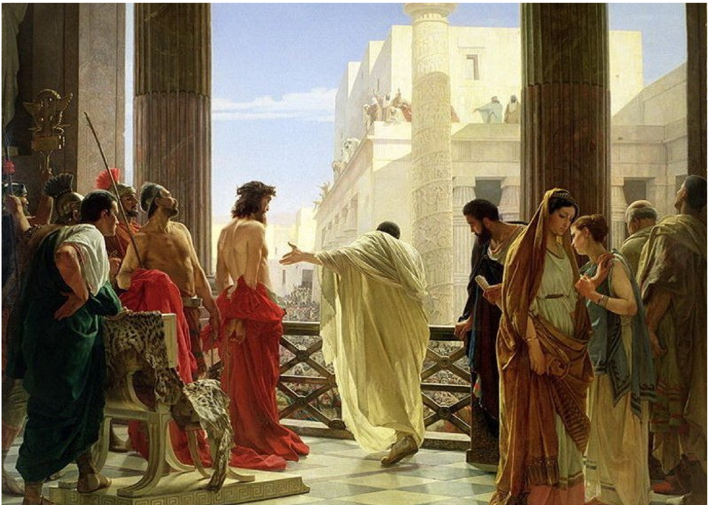
Ecce Homo , c. 1860-1880 (Antonio Ciseri)