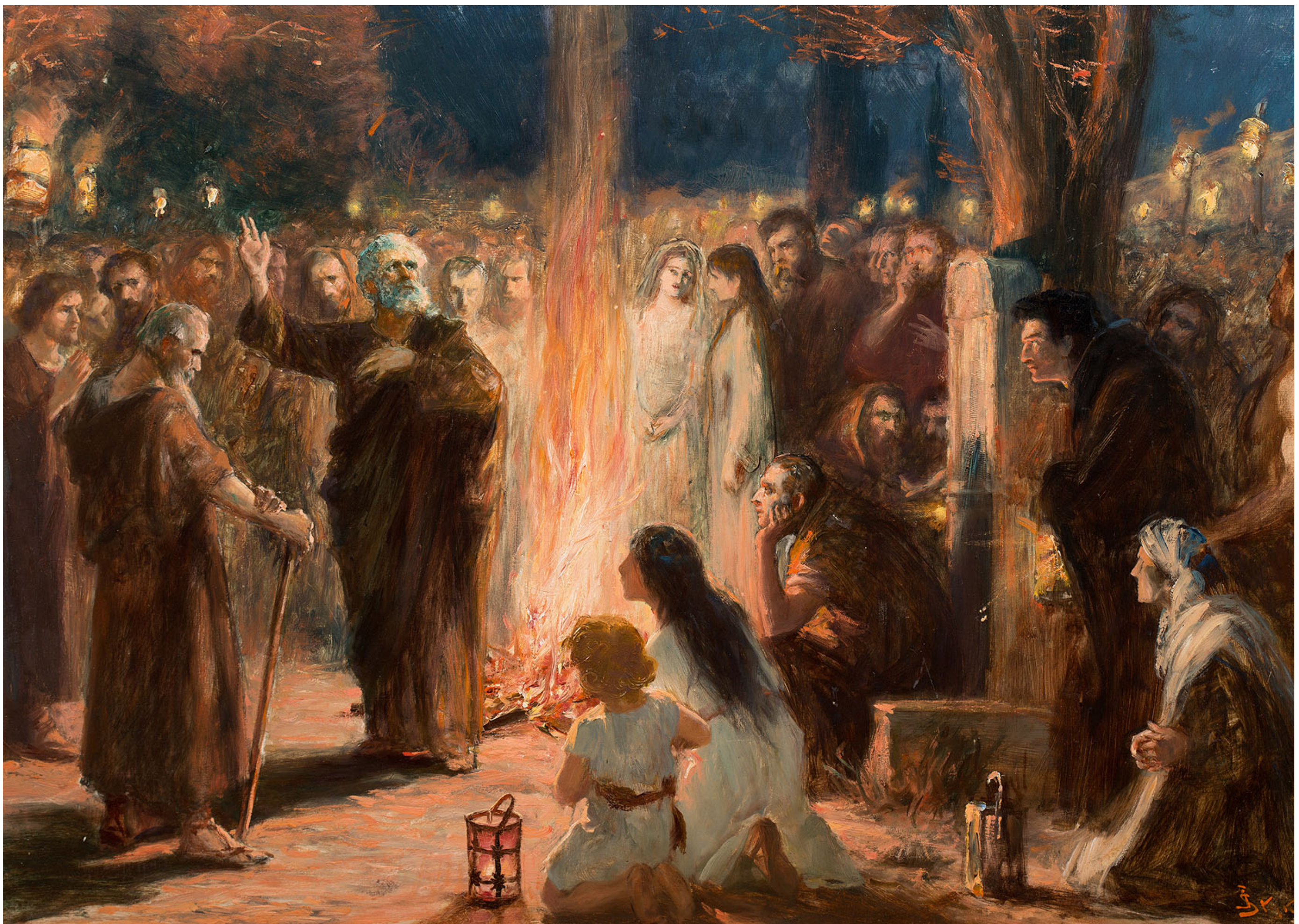
Peter Preaching at the Entrance to the Catacombs, c. 1901 (Jan Styka)