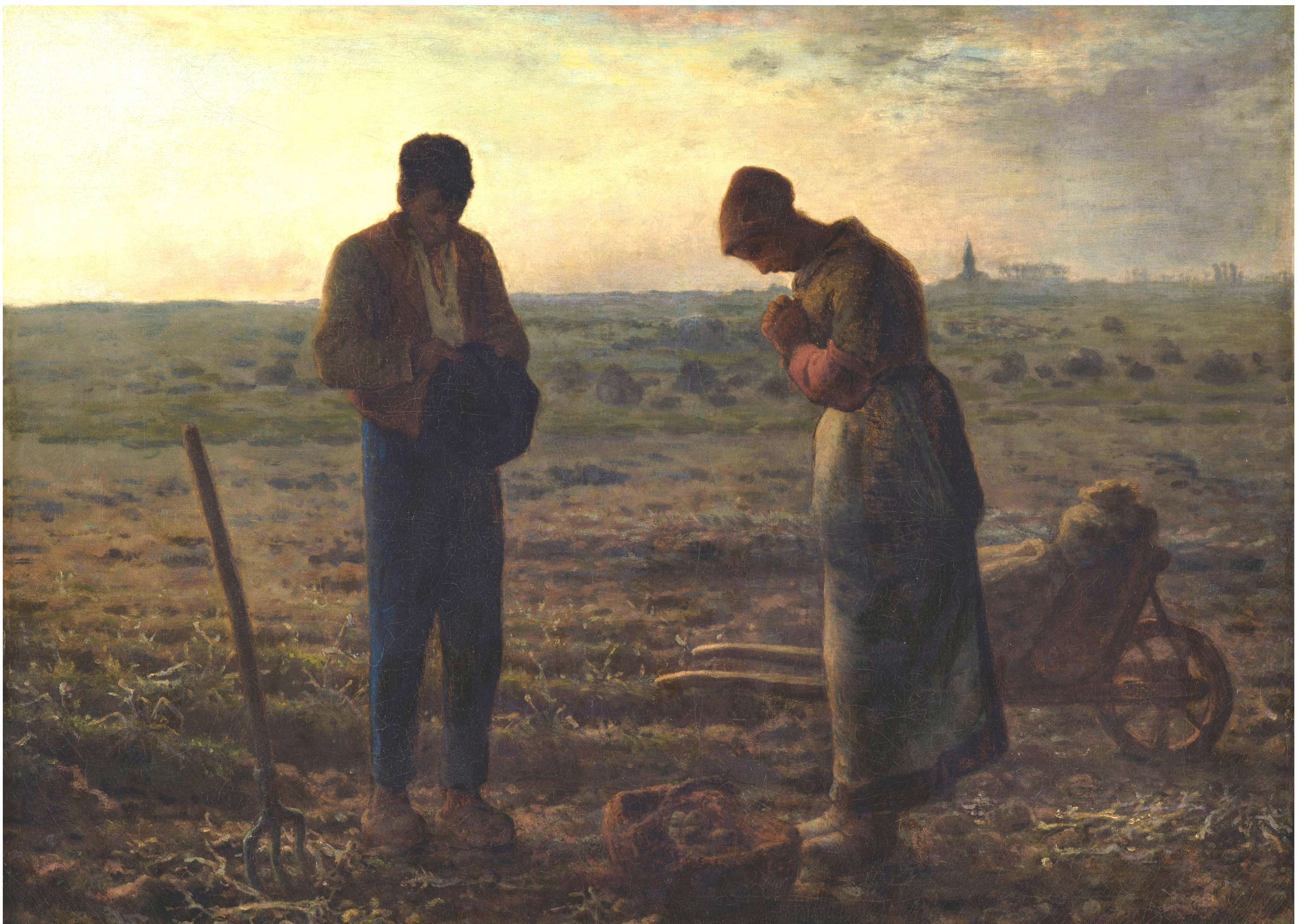
The Angelus , c. 1857-1859 (Jean Francois Millet)