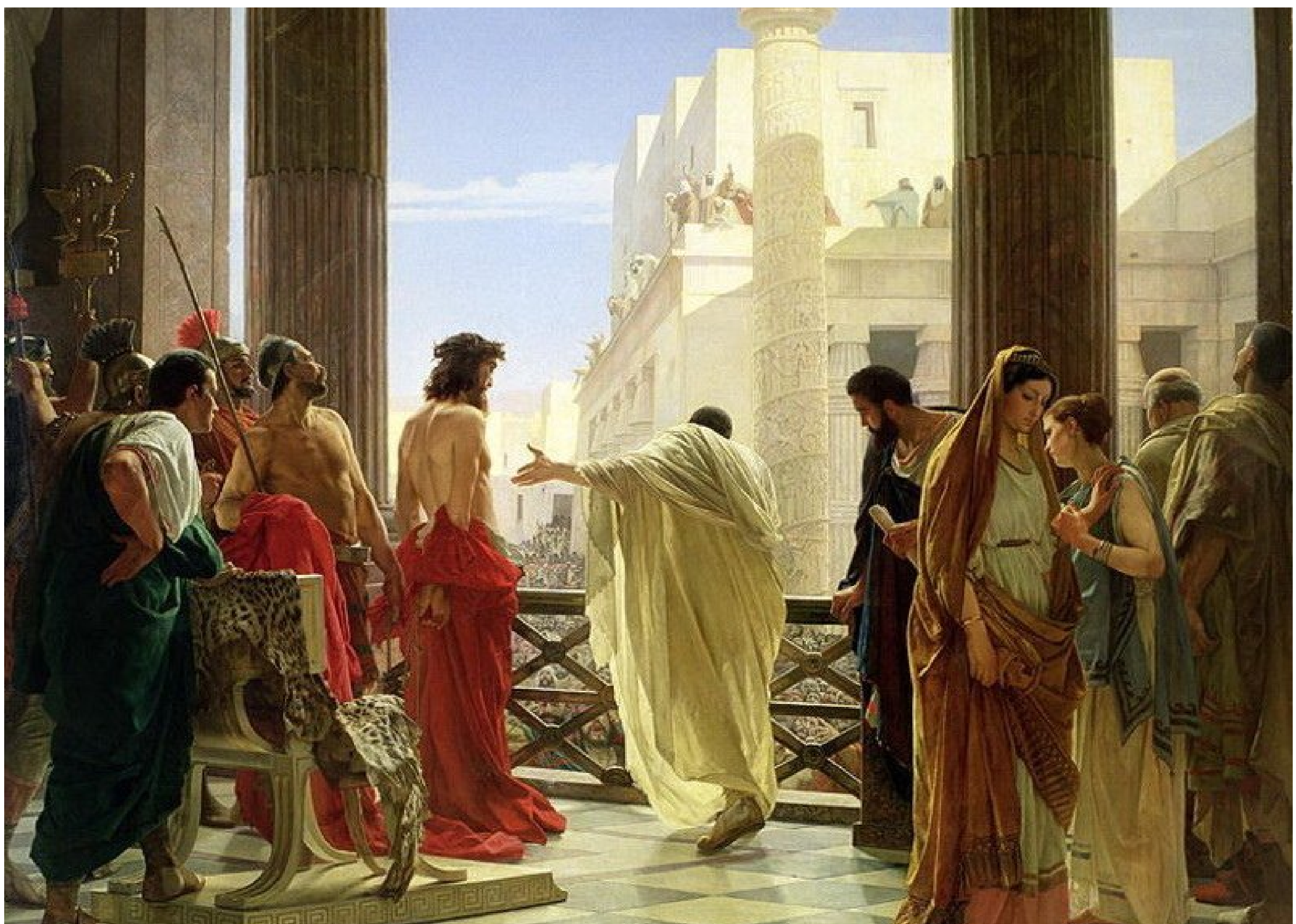
Ecce Homo , c. 1860-1880 (Antonio Ciseri)