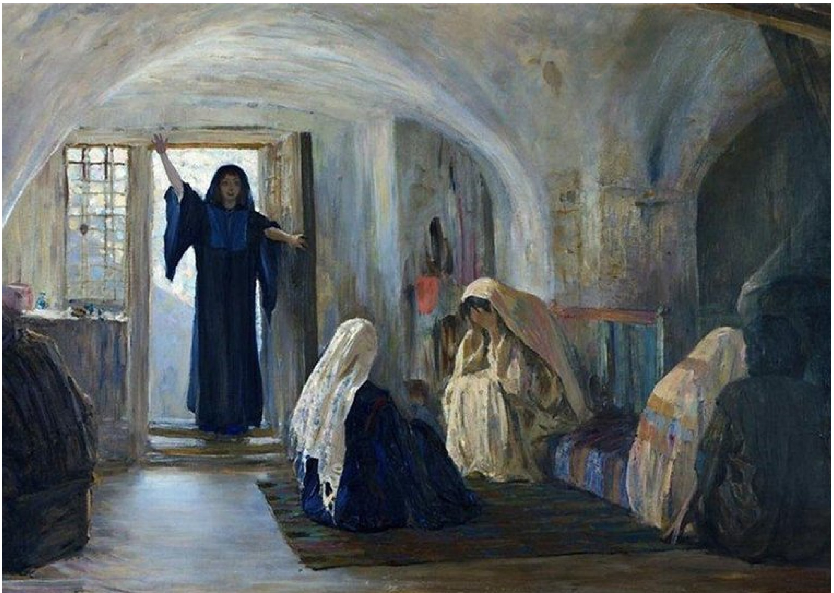
Mary Magdalene Announces the Resurrection to the Apostles, c. 1890 (Vasiliy Polenov)