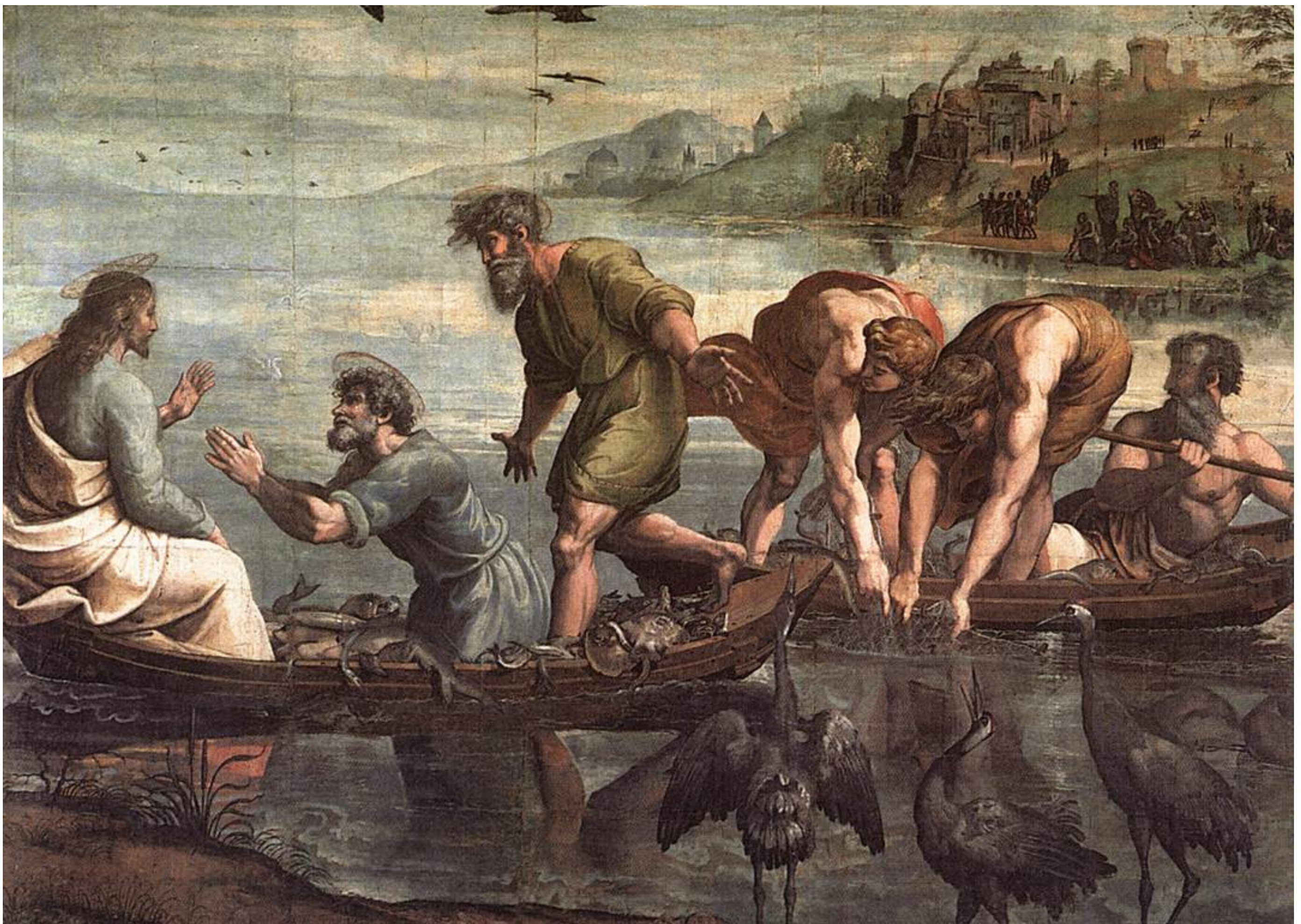
The Miraculous Draught of Fishes, c. 1515 (Raphael)