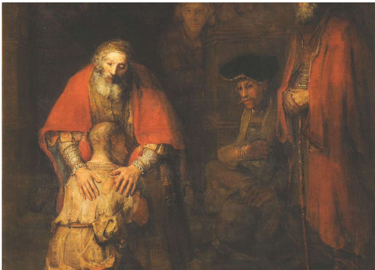
Return of the Prodigal Son, c.1661-1669 (Rembrandt)