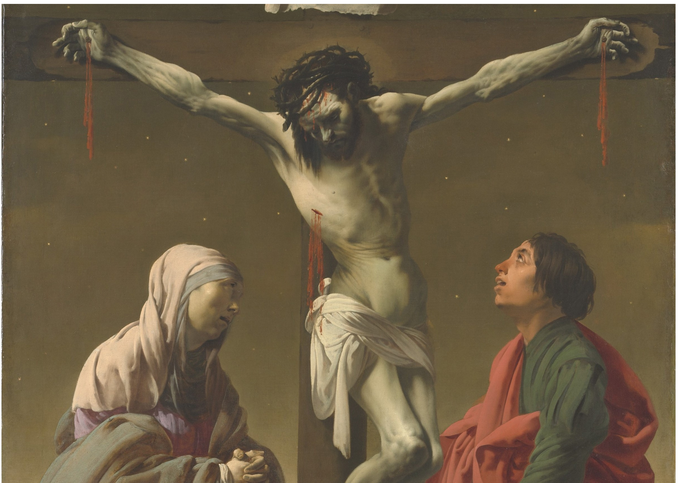
Crucifixion with the Virgin and St. John, c. 1625 (Hendrick ter Brugghen)