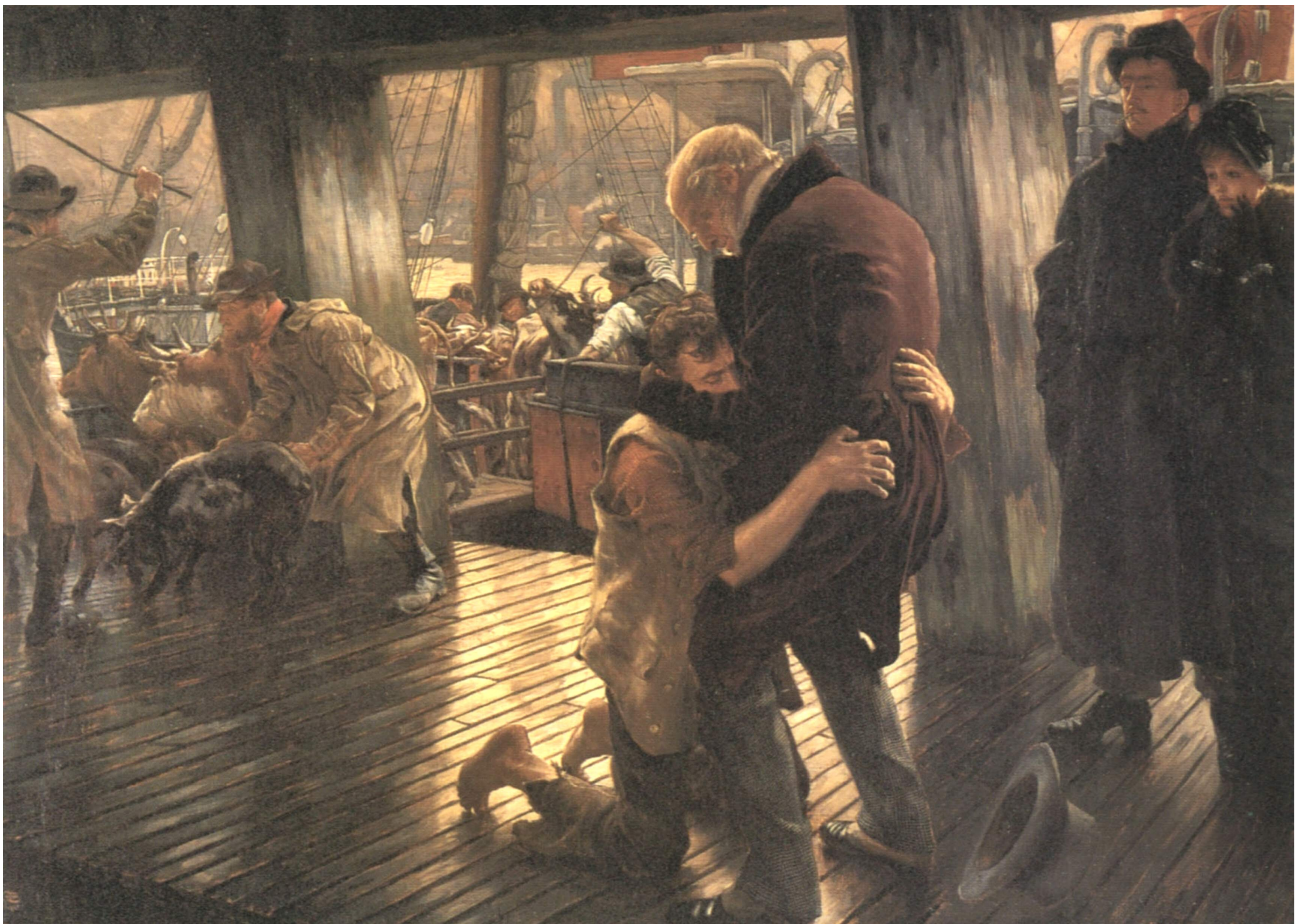
The Prodigal Son in Modern Life: The Return, c. 1882 (James Tissot)